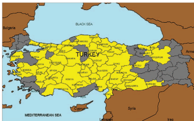
Figure 2. Distribution by city of the orthodontic patients who applied for treatment to Konya Selcuk University, Faculty of Dentistry, Department of Orthodontics.

To compensate for these problems, it would be beneficial for the government to provide services from freelance orthodontists or establish health institutions offering orthodontic services, thereby increasing the number of orthodontic specialists in the native cities of these patients. Certainly, as a first step, actual orthodontic treatment needs of patients should be evaluated objectively, and only after that should patients should be treated. The patients who will be treated should contribute to the cost of treatment at a ratio according to the significance of